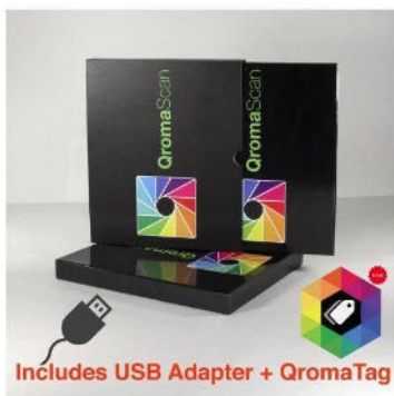
Qroma Total Bundle

* Photos should be removed from albums or frames prior to sending in. Digital images can be saved to disc or digital download in TIFF or JPG format, you can choose on the order form. Promo codes cannot be combined. Offer expires February 13th, 2019. Call for more details: (801) 782-5155.